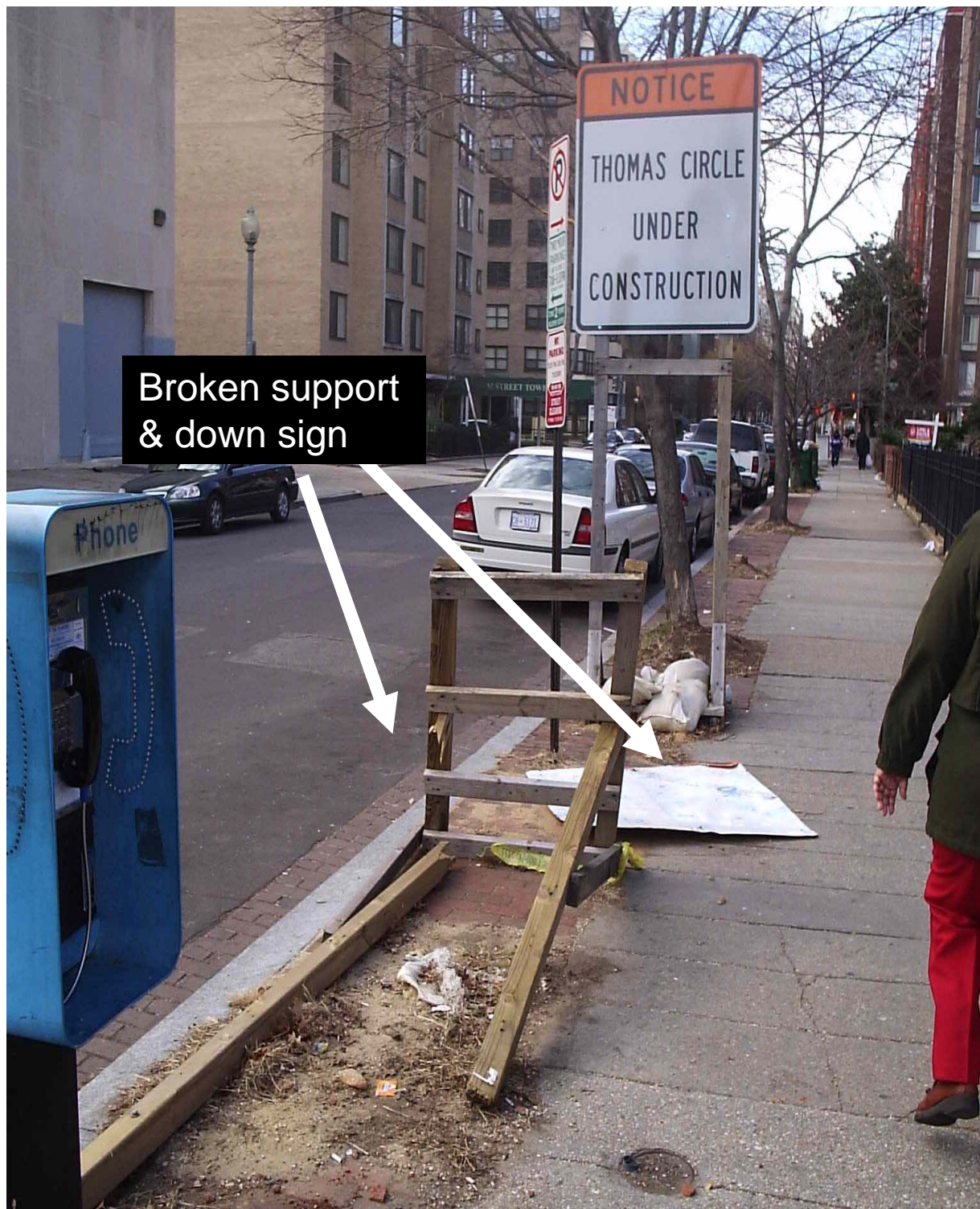
Down construction sign and support at the northwest corner of 11 th and M St's, NW